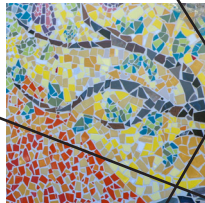
4. Art Tree Mural