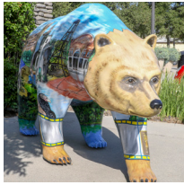
1. History Bear