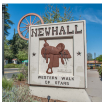
9. Western Walk of Stars saddles