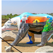
2. Amgen Bicycle Bear