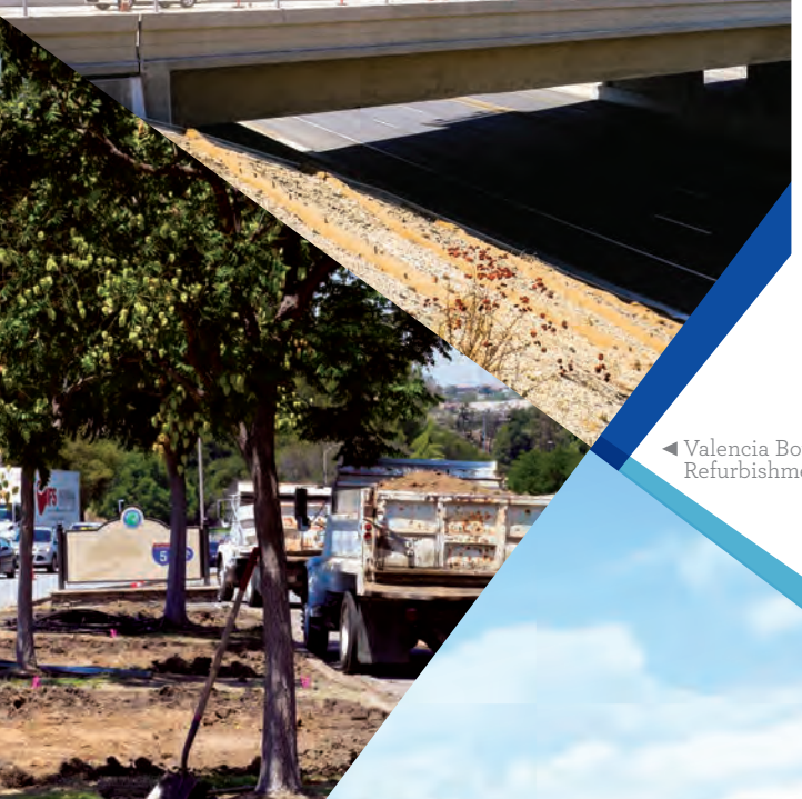
◀ Valencia Boulevard Median Refurbishment Project

The City has completed widening the Golden Valley Road Bridge which has been renamed as the Connie Worden-Roberts Memorial Bridge in remembrance of a local advocate and Santa Clarita community leader. The multi-million dollar project improves traffic flow entering and exiting the 14 Freeway via Golden Valley Road. An additional two lanes of travel have been added, one in each direction, for a total of four through lanes. Additional improvements include a dedicated left turn lane for the southbound 14 Freeway, two left turn lanes for the northbound 14 Freeway and a protected path for pedestrians and cyclists on the south side of the bridge.