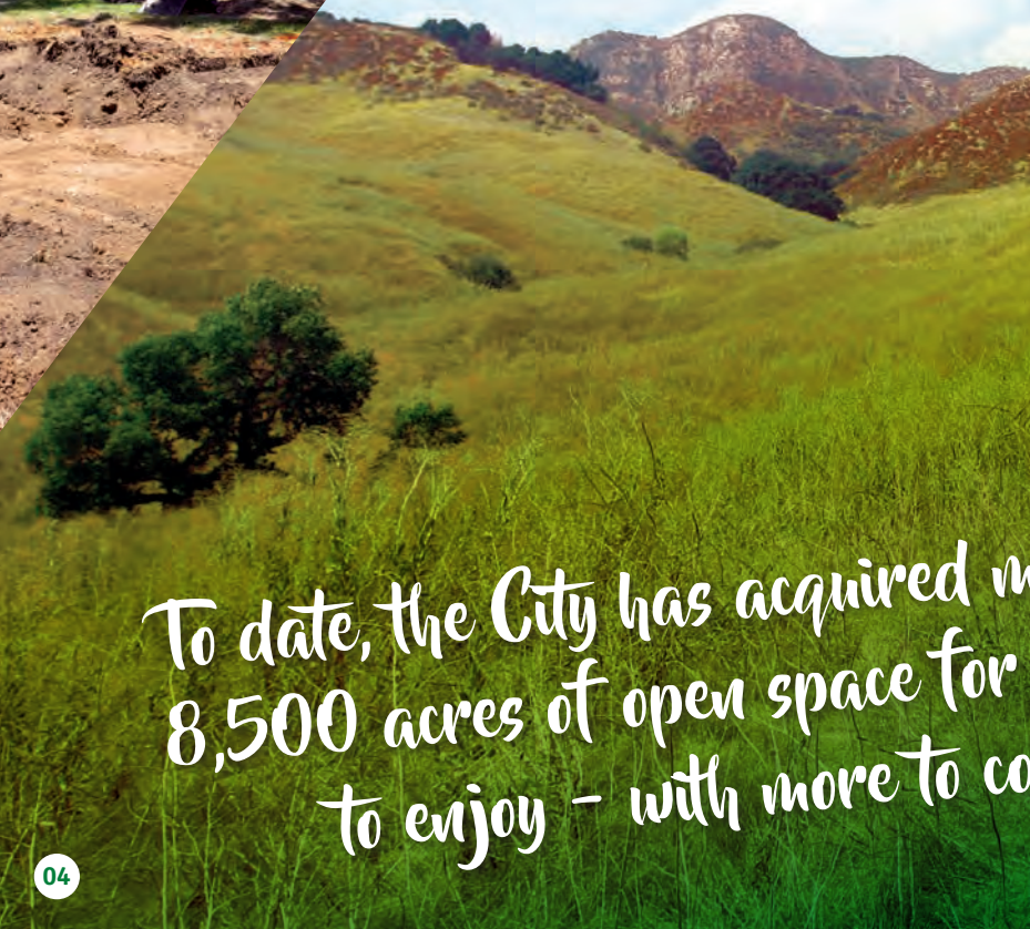
◀ Santa Clarita Open Space

To date, the City has acquired more than 8,500 acres of open space for residents to enjoy – with more to come. This year the City purchased more than 13 acres in the Soledad Canyon area adjacent to the City-owned Cemex property, preventing future mining in the area. The City also marked its first acquisition in the northwestern quadrant of the City's greenbelt with the purchase of more than 70 acres in Tapia Canyon. Nine acres have also been acquired through the Newhall Pass, creating an important connection between Wildwood Canyon Open Space and Gateway Ranch Open Space. The new Elder Loop and Taylor Trail at the Towsley Canyon were made easily accessible for hikers by the addition of 100 spaces in the parking area. To learn more about Santa Clarita's open spaces, visit HikeSantaClarita.com .