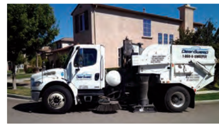
▲ Street Sweepers

The Annual Sidewalk and Concrete Rehabilitation Project repairs damaged sidewalks, curbs and gutters throughout the City that require attention due to issues like overgrown tree roots. This year, santa-clarita.com/Sidewalk was launched to provide residents with answers to frequently asked questions including how to request a repair and details on the construction process.