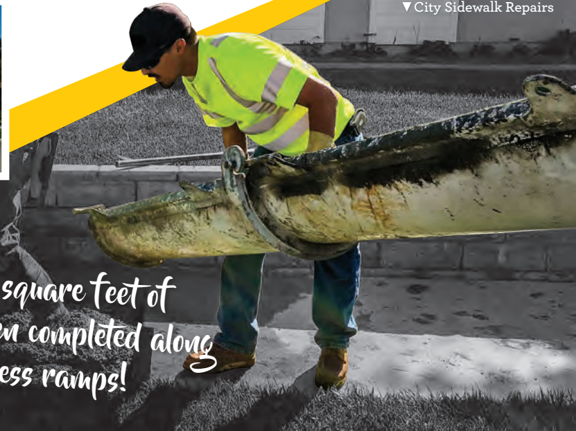
▼ City Sidewalk Repairs

Over 33,545 square feet of sidewalks have been completed along with 57 access ramps!