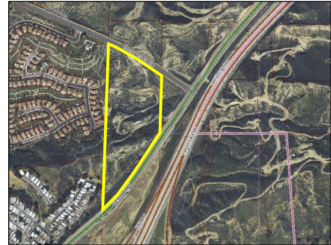
Sierra Highway / Dockweiler Drive