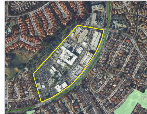
McBean Parkway and Orchard Village Road