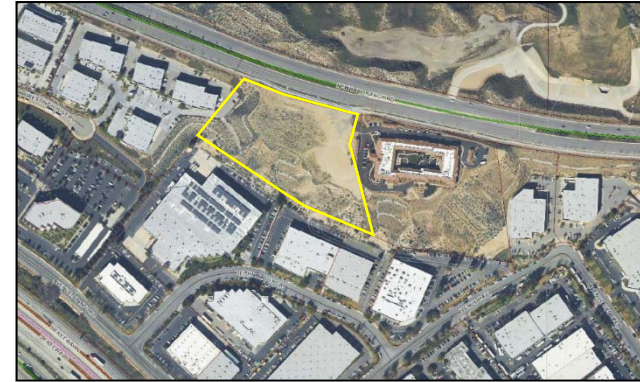
Newhall Ranch Road, East of I-5