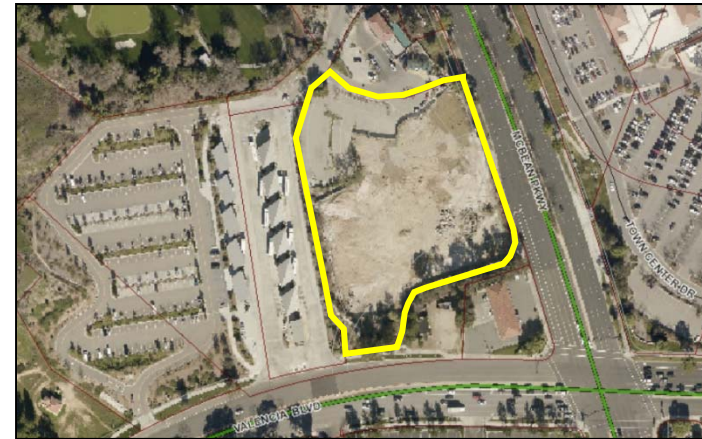
McBean Parkway and Valencia Boulevard