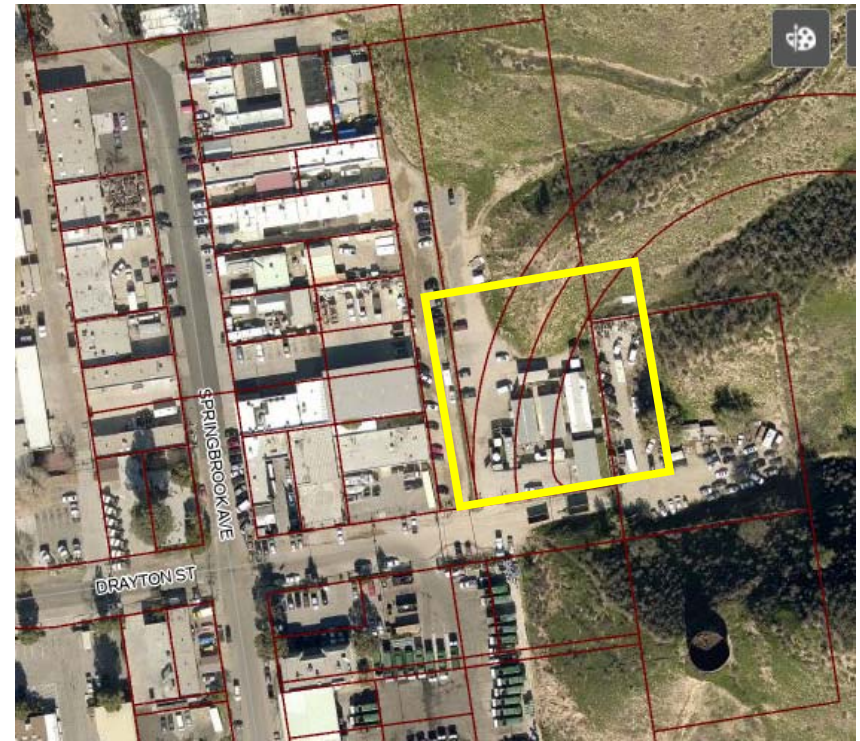
Drayton Street/ Springbrook Avenue