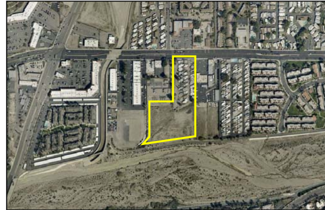
Soledad Canyon Road, east of Sierra Highway