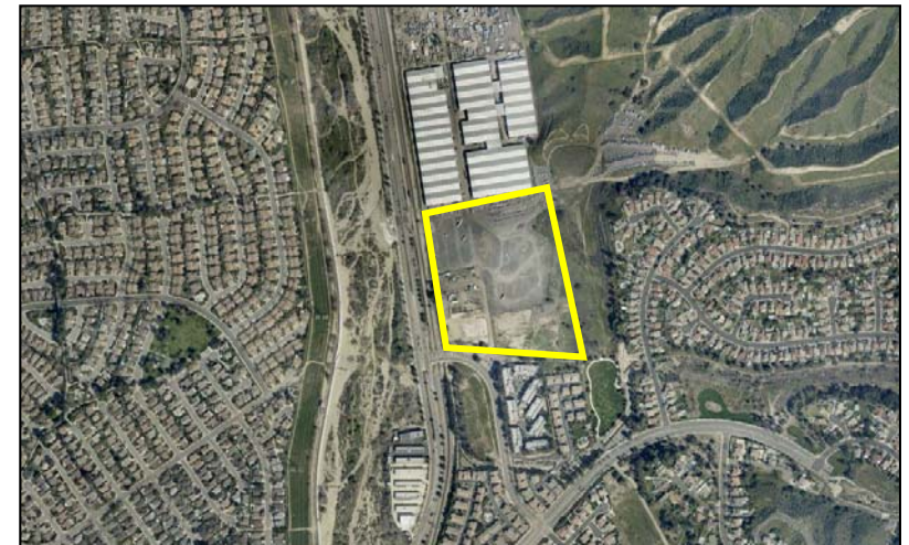
North of Oak Ridge Drive