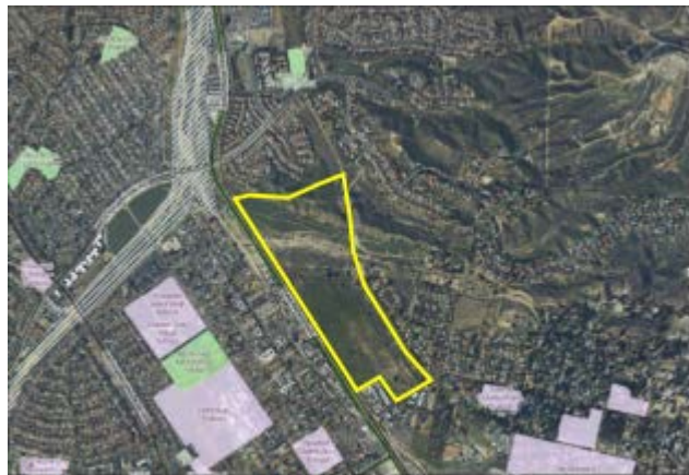
Railroad Avenue / 13 th Street