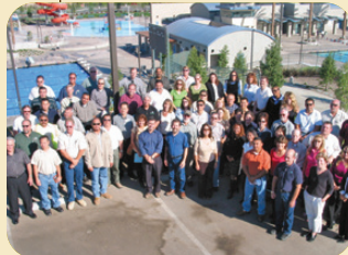
2003 SANTA CLARITA AQUATIC CENTER GRAND OPENING