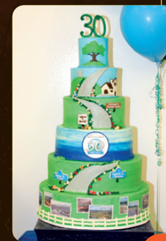
2017 CITY'S 30TH ANNIVERSARY