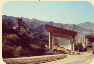
1994 NORTHRIDGE EARTHQUAKE