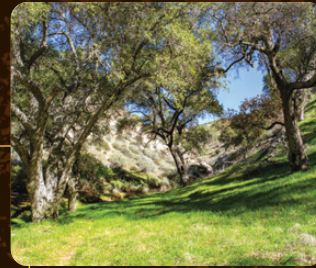
2007 OPEN SPACE PRESERVATION DISTRICT APPROVED