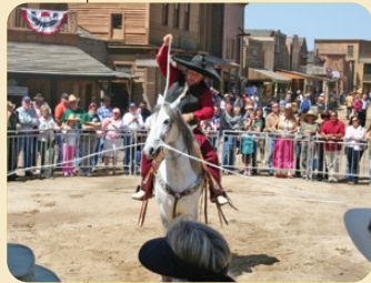
1994 FIRST CITY OF SANTA CLARITA COWBOY FESTIVAL