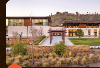
2021 THE CUBE, SANTA CLARITA VALLEY SHERIFF'S STATION, CANYON COUNTRY COMMUNITY CENTER GRAND OPENINGS