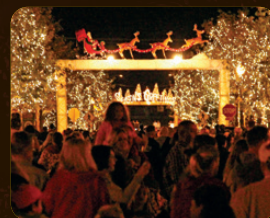
2013 FIRST LIGHT UP MAIN STREET

Thanks to the leadership of the City Council, Santa Clarita offers a safe, family-oriented community for residents to live, work and play. This is affirmed by regular awards and top rankings. Santa Clarita has won more prestigious Helen Putnam Awards for Excellence from the League of California Cities than any other city in the state. In addition, our City has been ranked as the third Safest City in California to raise a family by Safewise, the third Safest City in America by SmartAsset and the 14th Most Physically Active City in the nation by Chamber of Commerce.