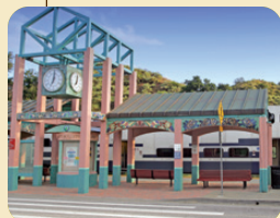
1991 SANTA CLARITA TRANSIT BEGINS SERVICE