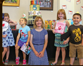
2016 SANTA CLARITA PUBLIC LIBRARY 5 YEAR ANNIVERSARY