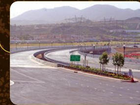
2010 CROSS VALLEY CONNECTOR OPENS