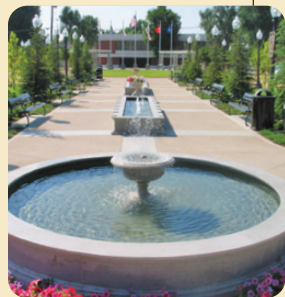
2005 VETERANS HISTORICAL PLAZA OPENS