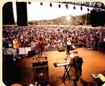
1990 FIRST CONCERTS IN THE PARK