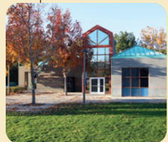
1988 FIRST PARKS COMMISSION CREATED

Other benefits of Cityhood include 100 miles of off-street trails, more than 13,000 acres of preserved open space, three Metrolink Stations (with one more on the way), three Santa Clarita Public Library Branches, two Community Centers, anti-drug programs for youth, world-class events, hundreds of sports and recreation programs, the Aquatic Center, the Santa Clarita Skatepark, a new Santa Clarita Valley Sheriff's Station, The Cube – Ice and Entertainment Center, the Trek Bike Park of Santa Clarita, an inclusive playground (with one more on the way), traffic and road improvements, preventing a new landfill – just to name a few.