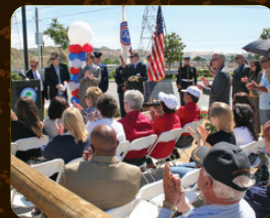
2011 FALLEN WARRIORS MEMORIAL BRIDGE DEDICATION