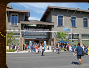
2012 OLD TOWN NEWHALL LIBRARY GRAND OPENING