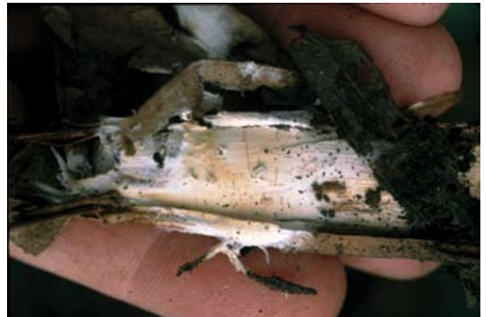
Figure 4. Ceraciomyces tessulatus is a potent cellulase producer. The fruiting body looks like paint on the wood surface it is decaying.

A coarse mulch layer cuts evaporative water loss from soils thus preserving moisture for root absorption. This source of moisture is especially useful to shallow rooted trees such as avocado. I have found in various studies that mulched trees can skip every other irrigation compared to non-mulched trees and maintain the same soil matric potential (Downer, 1998; Downer and Hodel, 2001; Downer and Faber, 2005). The caveat here is that the mulch must be coarser than the underlying soil. Mulches texturally finer than the soil underneath them can lead to increased moisture loss and drying (Svenson and Witte, 1989). Moisture savings by mulches is greatest when there is maximum exposure of soil to the sun, before