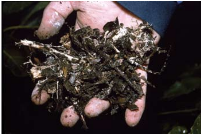
Figure 3. Fungi grow through mulch with mycelium and rhizomorphs that secrete enzymes (cellulases) which have been shown to control root diseases.