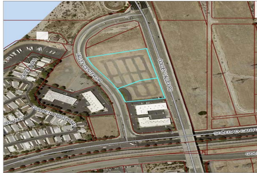
Northwest Corner of Golden Valley Road & Soledad Canyon Road