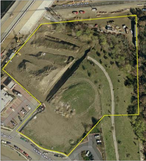
East of Sierra Highway / Flying Tiger Drive