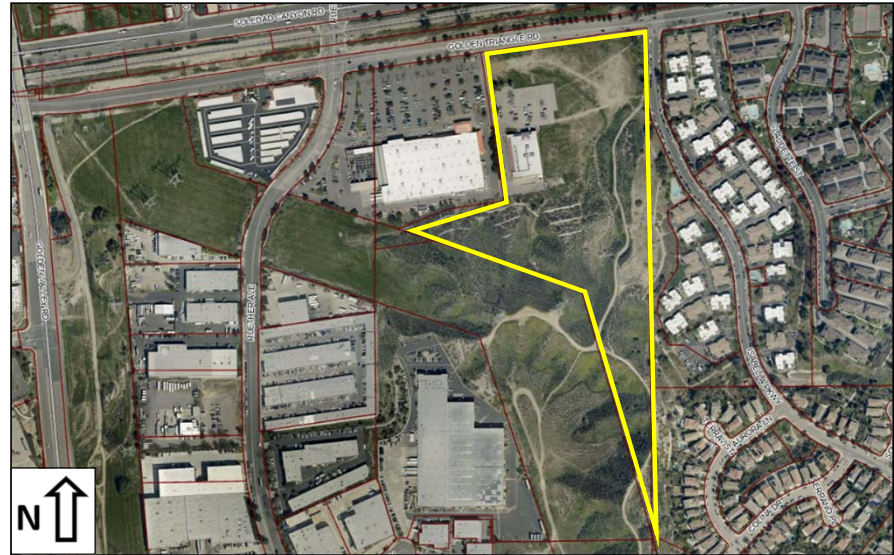
Golden Triangle / Isabella Parkway