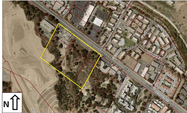
Southeast corner of Newhall Avenue & Carl Court