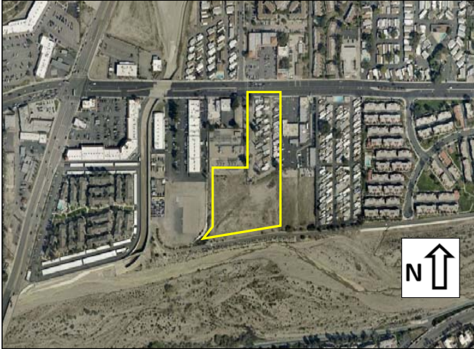
Soledad Canyon Road, east of Sierra Highway