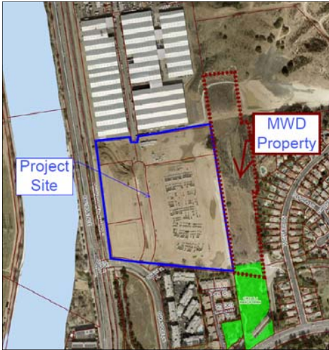
North of Oak Ridge Drive