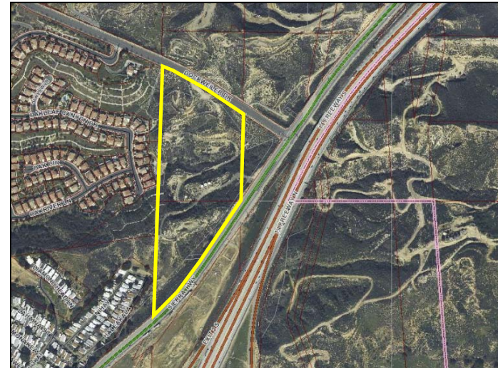
Sierra Highway / Dockweiler Drive